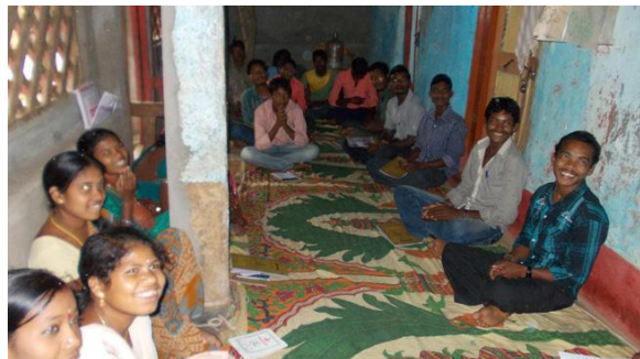
The youth participants interact with a presenter the third day of training