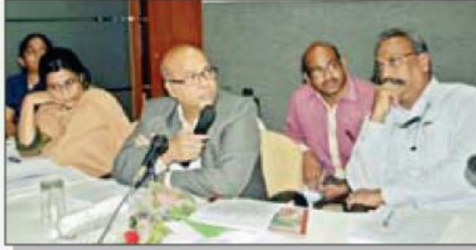
ఫిర్యాదులపై విచారణ్ను జాతీయ బాలల హక్కుల కమిషన్ జ్యూరీ