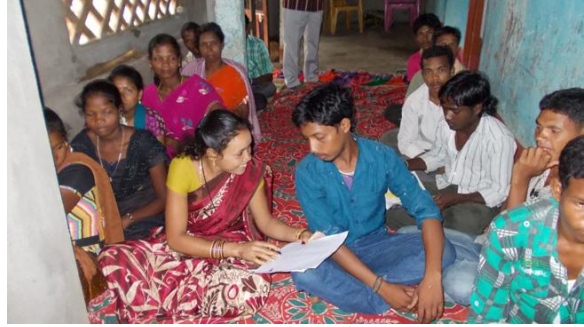
Volunteers on the first day of the three day training program