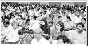
బహిరంగ విచారణకు హాజరైన విద్యార్థులు, తల్లిదండ్రులు, ఎన్సీపీసీఆర్ సభ్యులు

పరిశీలించిన కేసులు... విద్యార్థుల జిల్లా పరిషత్ పాఠశాలలను పరిశీలించి అవి అనుకూలంగా ఉన్నాయా లేదో తెలుసుకోవడం కోసం ఎన్సీపీసీఆర్ జ్యూరీ సభ్యులు విద్యార్థులను పాఠశాలలకు పంపిస్తూ పరిశీలించారు. ఈ సందర్భంగా విద్యార్థులు, తల్లిదండ్రులు, స్వచ్ఛంద సంస్థల ప్రతినిధులు, అధికారులు విచ్చేసింది. ఈ సందర్భంగా విద్యార్థులు, తల్లిదండ్రులు, స్వచ్ఛంద సంస్థల ప్రతినిధులు, అధికారులు విచ్చేసింది.