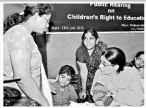
విశాఖ పాఠశాల విద్యార్థులు ఈ కుటుంబ సంక్షేమ శిబిరంలో పాఠశాల విద్య పొందే అవకాశం గురించి తెలుసుకోవడం కోసం పాల్గొన్నారు.