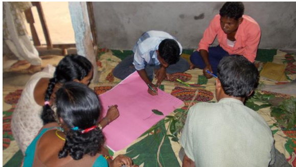
A group of volunteers prepares a chart for their presentation on various types of local plants and their uses