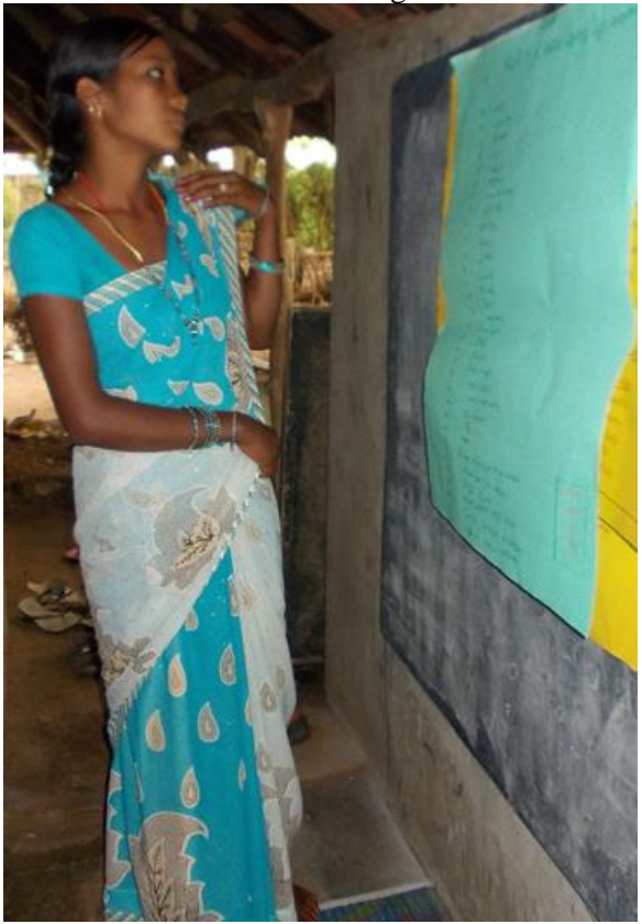
Teams present their charts on RTE and role of SMCs: 17-07-2012