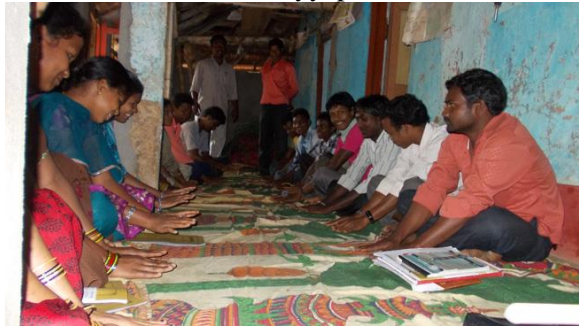
Volunteers taking part in a game during the training session