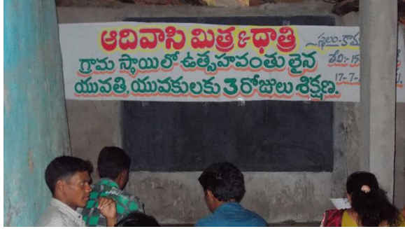
VEV Youth Training 15th to 17th July - Kamayyapeta