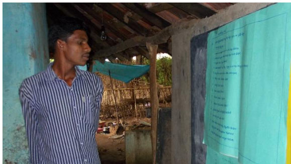
Teams present their charts on RTE and role of SMCs on the last day of training