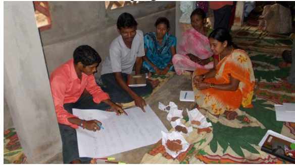
Volunteers write about the variety of soils they collected during a group activity on the second day of training