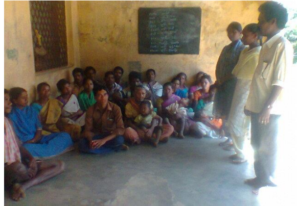
Meeting with SMC members, Lolangipadu