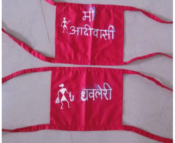
Mask Campaign in Melghat district with Children for right to Quality and Cultural Education