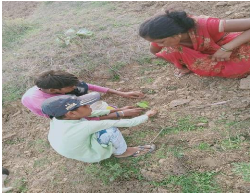
Children Planted Mahua and other wild plants in Panna