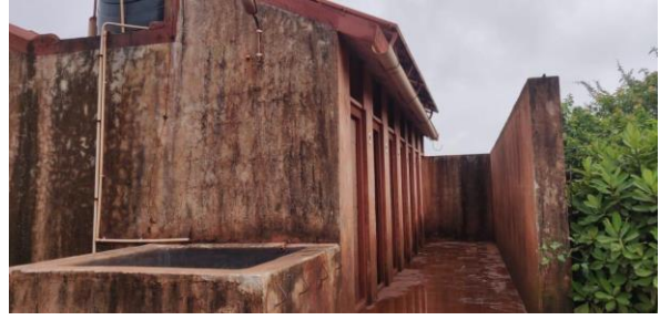
Government primary school got smart class in P.K Halli under DMF Fund