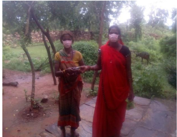
Organic Vegetable Seeds distributed to Adivasi women for setting up kitchen gardens in Dahod.