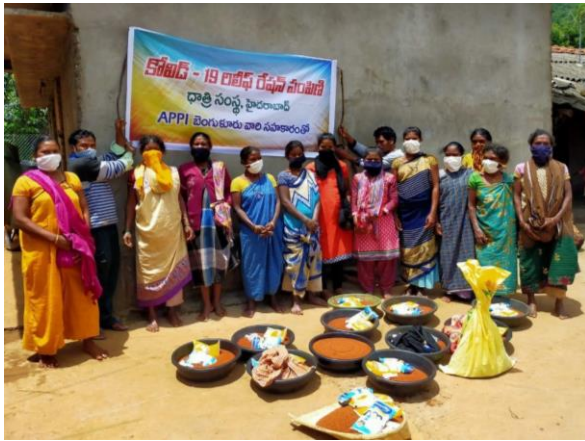
Ration Kit (1100 kits) distribution in Andhra Pradesh Visakhapatnam district of Paderu Mandal in three Panchayat of Salugu, Vantlamamidi and Modapalli.