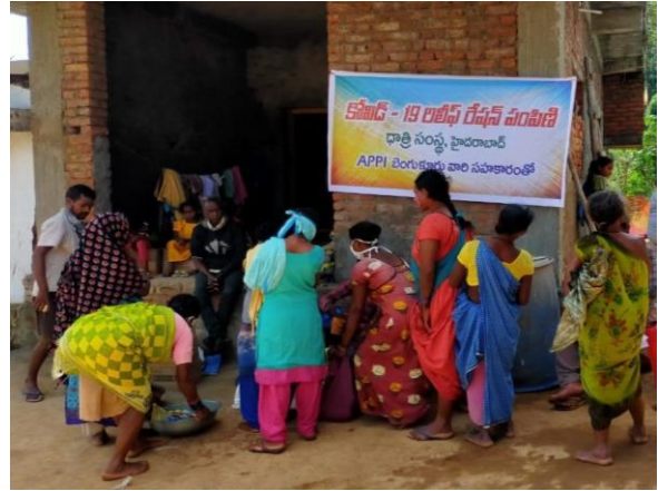
COVID relief distribution to 500 single and widowed women in Palghar district