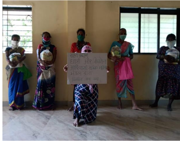
COVID relief distribution (500 kits) to single and widowed women of Bhil and Pateliya communities in Dahod district.