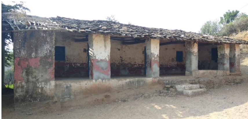
Gender Impact Assessment and Women's situation in the Mining area of Madhya Pradesh.