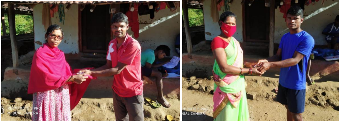
Organic Vegetable Seeds distributed to Adivasi women for setting up kitchen gardens in Rewa