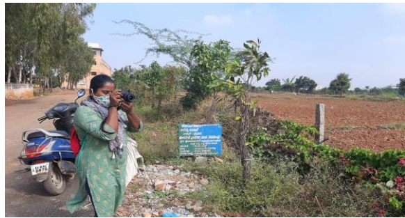
DMF social audit of schools constructed in Kojawala, Pipli, Rajasthan.