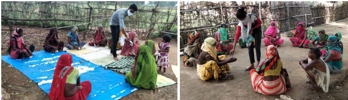
Organic Vegetable Seeds distributed to Adivasi women for setting up kitchen gardens in Udaipur.