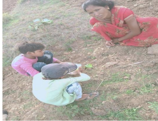
Provided Nutritional Mahua laddu supplementary food to the Children in Panna, Madhya Pradesh.