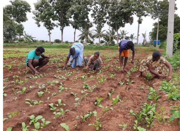
Van Devi Sva Sahayata Samooh, a women's group in Panna took up group activity with collection of Mahua seeds, extraction and marketing of Mahua oil