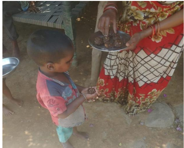
Learning through online and offline fun activities in summer in Panna, Madhya Pradesh