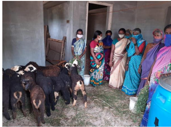
Agriculture activities by Devadasi and Landless Women and Youth in Hospet, Karnataka.