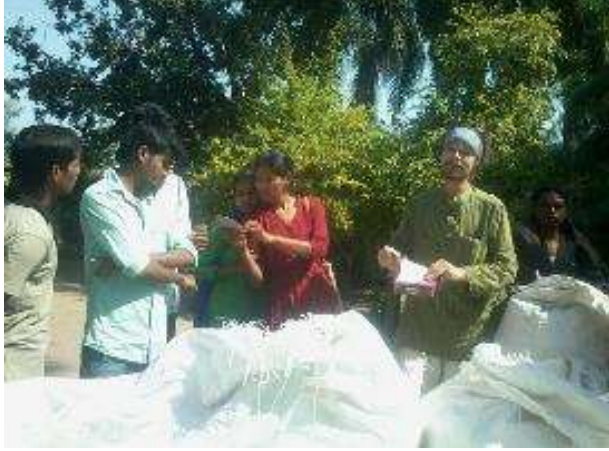
Waste management process