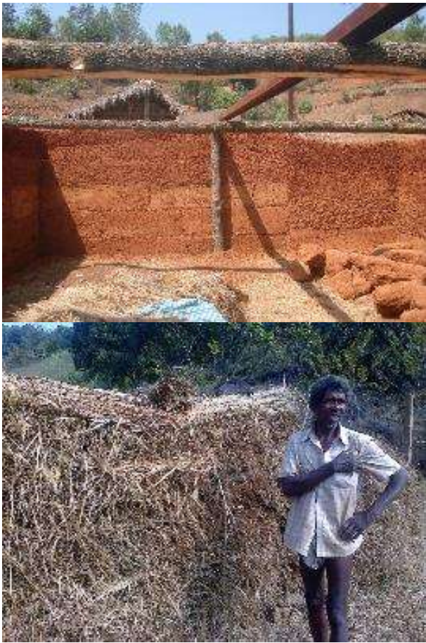
Grass for Community Centre at Poolabanda