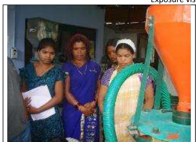
Exposure visit to Kotagiri