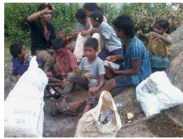
Cleaning and Waste management