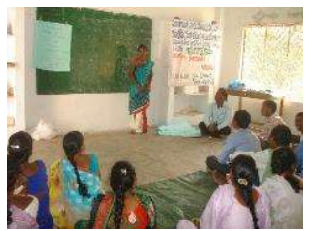
Ward Members Training