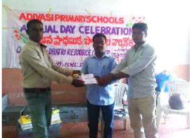
Education Support /Student Aid