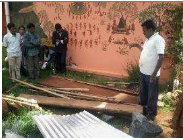
About low cost housing