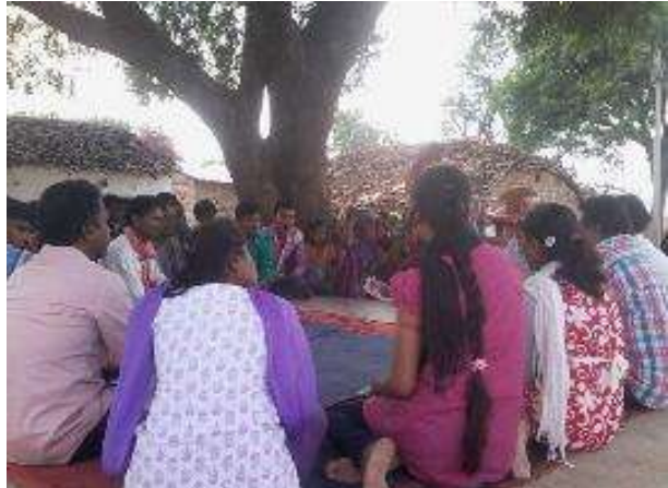
Gender Training in Vijayawada