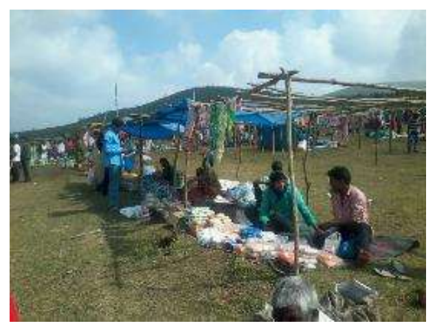
Weekly market at Buruguchettu