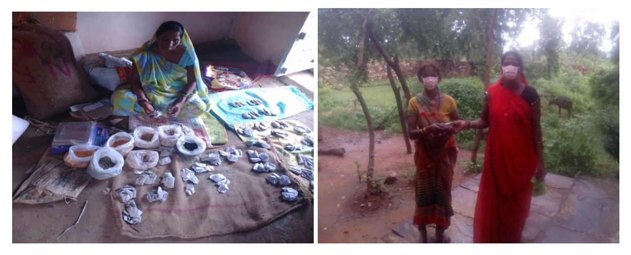
Organic Vegetable Seeds distributed to Adivasi women for setting up kitchen gardens in Dahod.