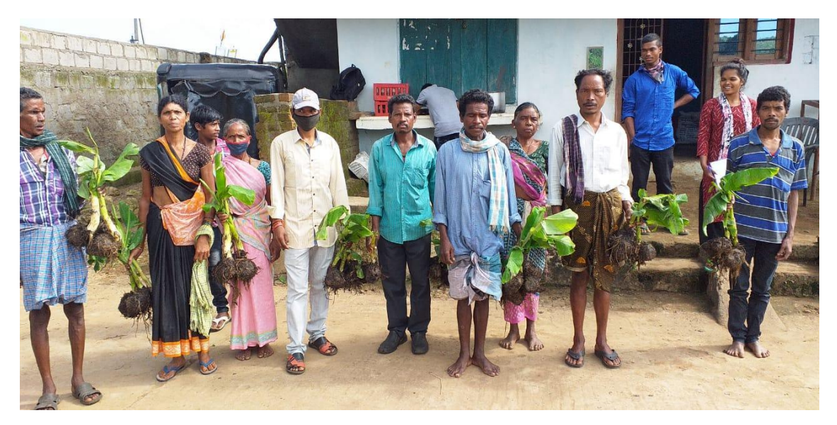
Organic Vegetable Seeds distributed to Adivasi women for setting up kitchen gardens in Panna.