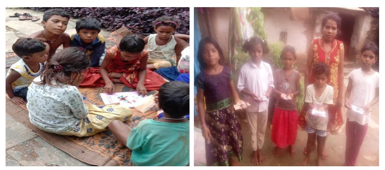
Bamboo craft making with youth from the community