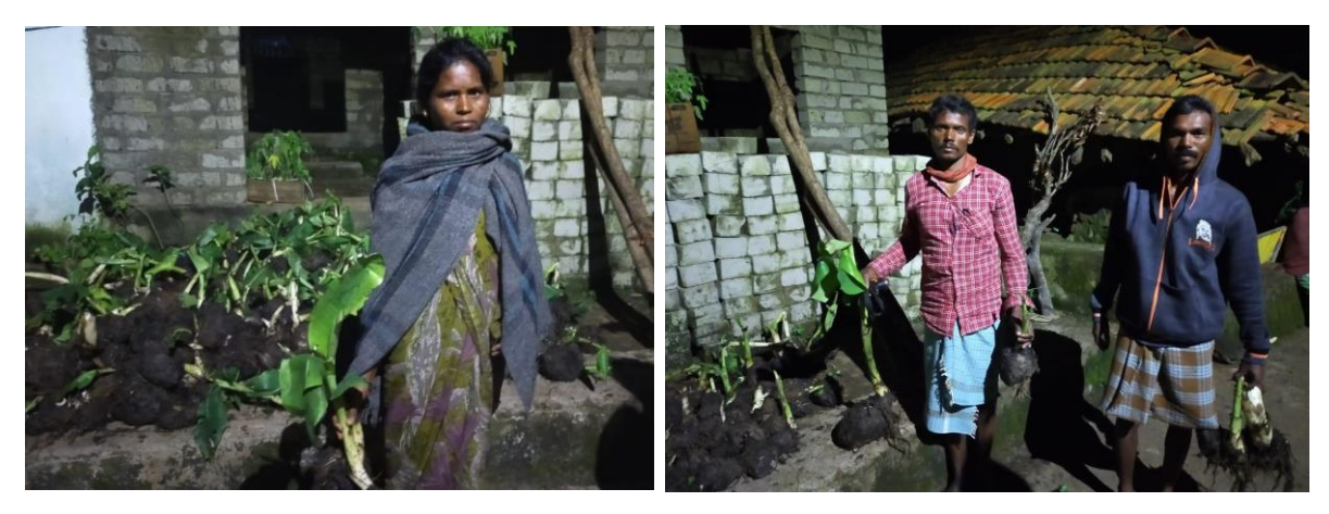
Distributed Banana plants to Adivasis in Paderu

We distributed Bamboo sapplings to Adivasi women in Panna.