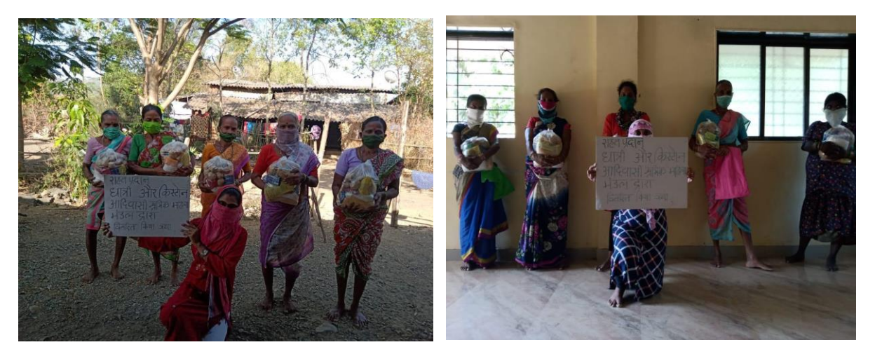
COVID relief distribution (500 kits) to single and widowed women of Bhil and Pateliya communities in Dahod district.

COVID relief distribution to 500 single and widowed women in Palghar district