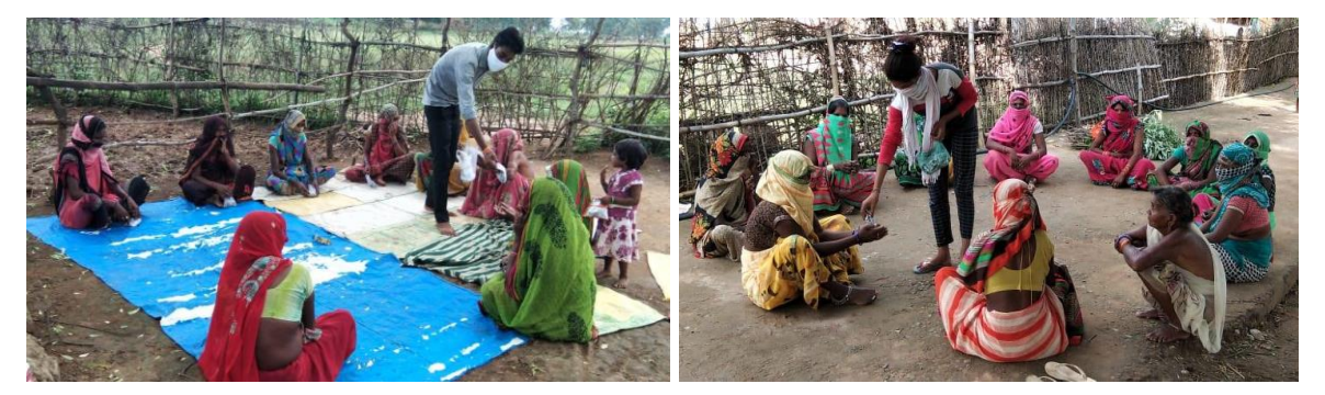
Organic Vegetable Seeds distributed to Adivasi women for setting up kitchen gardens in Udaipur.